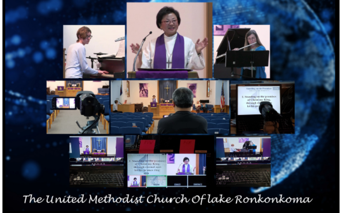
The United Methodist Church Of lake Ronkonkoma