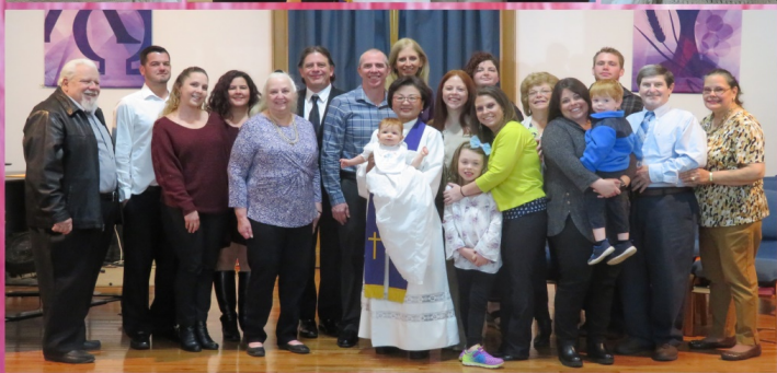
The United Methodist Church Of Lake Ronkonkoma