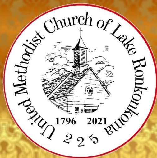
Official 225th Anniversary Logo