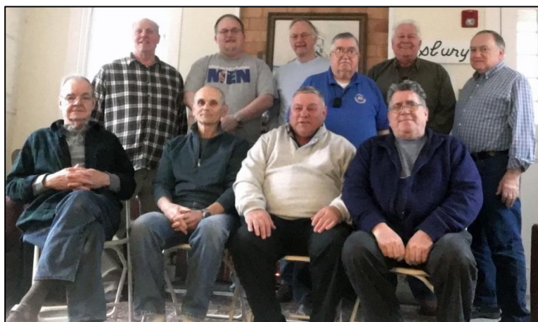
The UM Men enjoyed a great retreat at Quinipet, January 24-26, 2020.