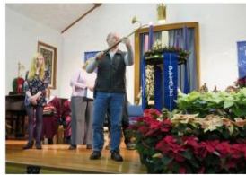
Candle of Hope