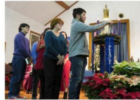
Candle of Peace