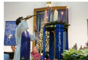
The Christ Candle