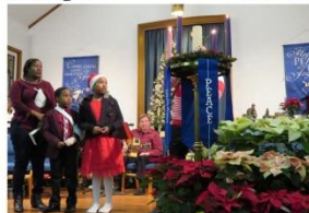
Candle of Love