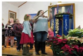
Candle of Hope