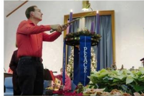
Candle of Peace