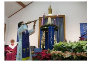
The Christ Candle