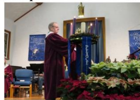
Candle of Love