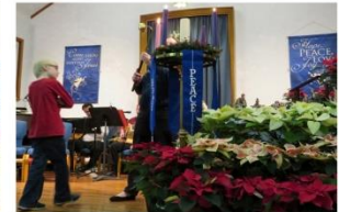
Candle of Joy