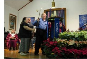
Candle of Joy