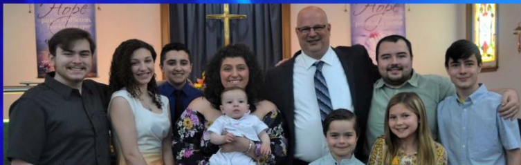
The United Methodist Church Of Lake Ronkonkoma