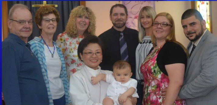
The United Methodist Church Of Lake Ronkonkoma