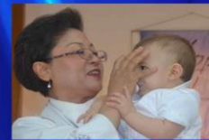
Born - September 9, 2018