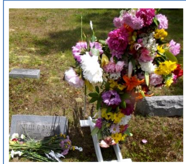
Nettie Baker Day - June 8, 2014

Nettie Baker Day Sunday, June 11 10:00 AM