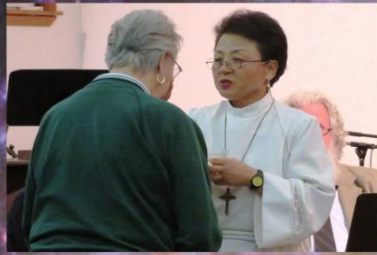
My God, my God, why have you forsaken me?

"FATHER, INTO YOUR HANDS I COMMIT MY SPIRIT"