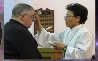
Father, forgive them, for they do not know what they do.