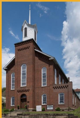
Andrews Methodist Episcopal Church

The modern holiday was first celebrated in 1907, when the first Mother's Day worship service was held at Andrews Methodist Episcopal Church in Grafton, West Virginia. Peace activist Ann Jarvis who cared for many wounded soldiers on both sides during the Civil War, created "Mother's Day Work Clubs" to address public health issues. Ann and suffragette Julia Ward Howe had been asking for the creation of a "Mother's Day For Peace" where mothers would ask that their husbands and sons no longer be killed in wars.