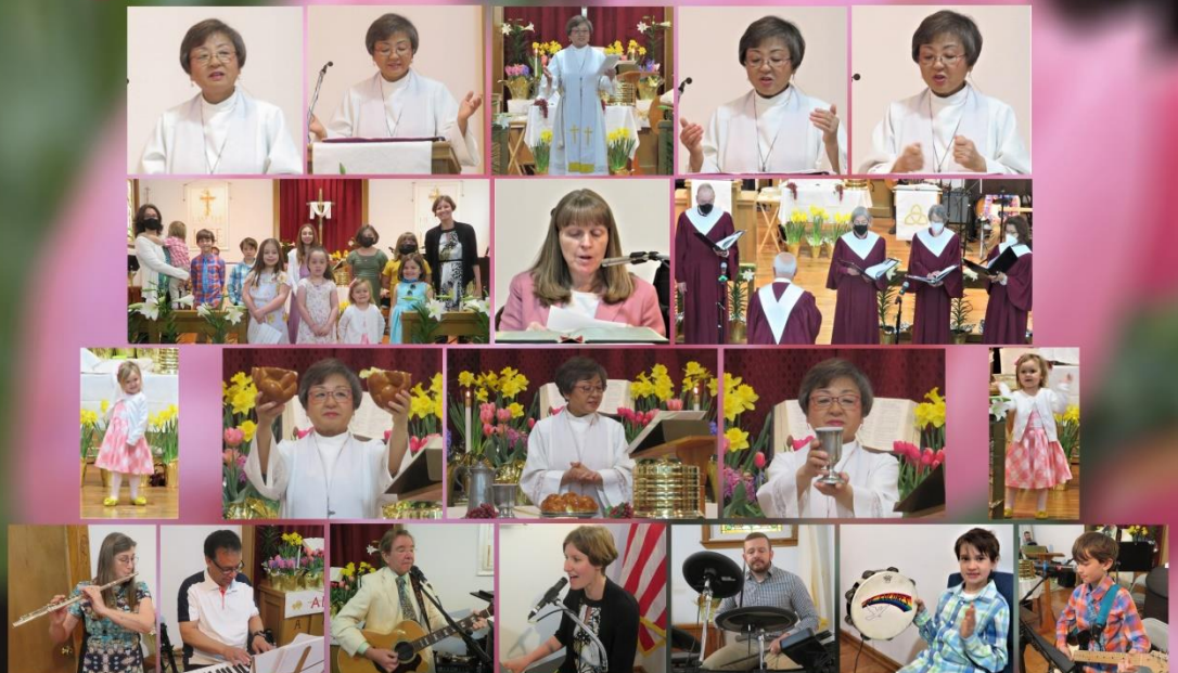
The United Methodist Church Of Lake Ronkonkoma