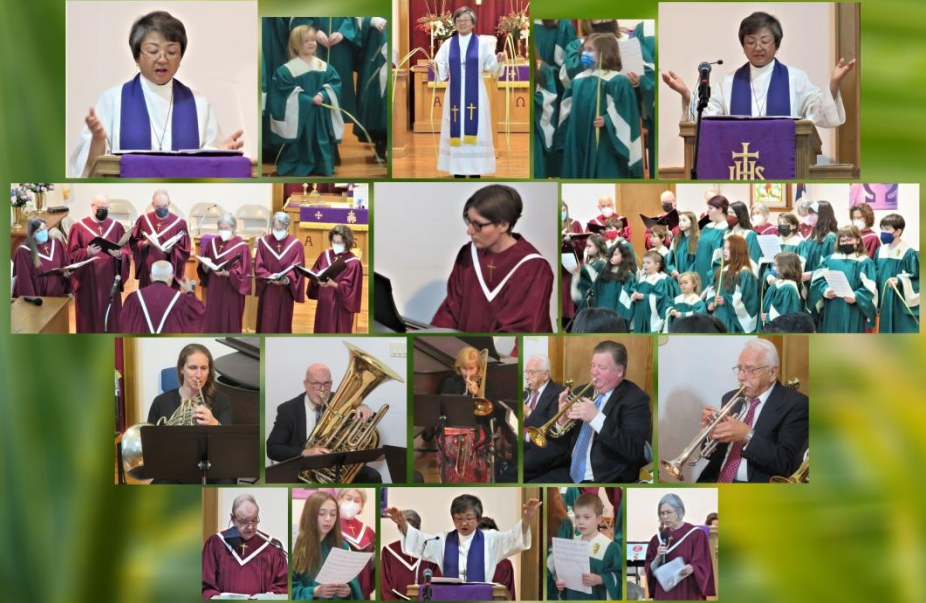
The United Methodist Church Of Lake Ronkonkoma