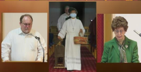
The United Methodist Church Of Lake Ronkonkoma