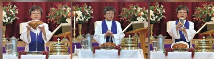
The United Methodist Church Of Lake Ronkonkoma