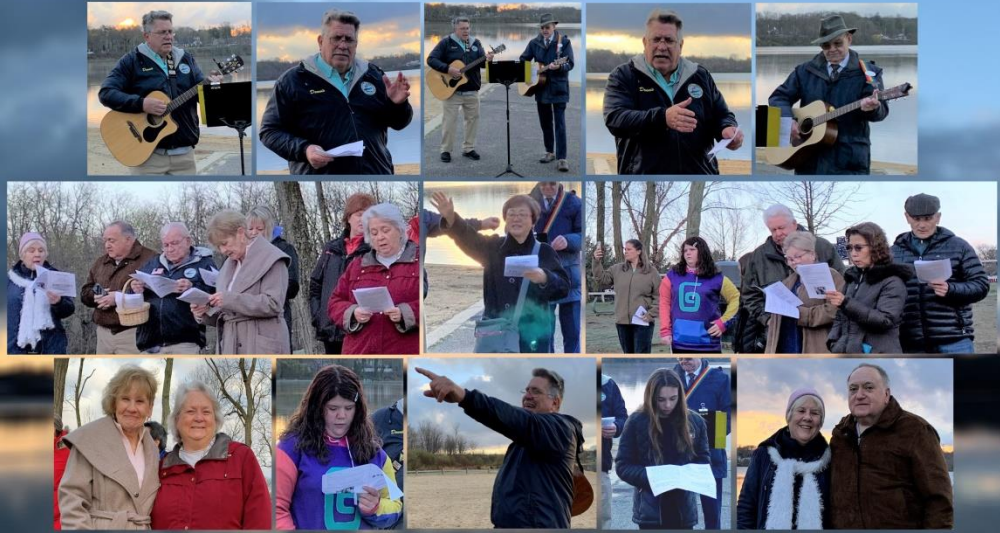
The United Methodist Church Of Lake Ronkonkoma