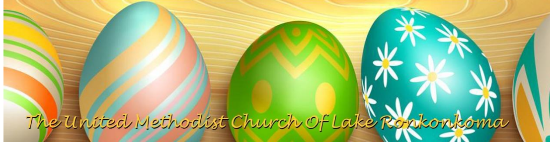
The United Methodist Church Of Lake Ronkonkoma