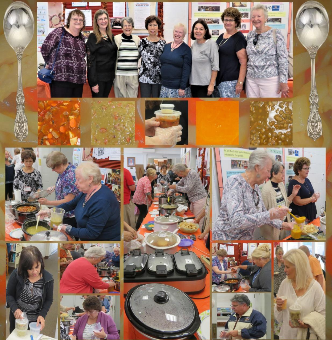
The United Methodist Church of Lake Ronkonkoma