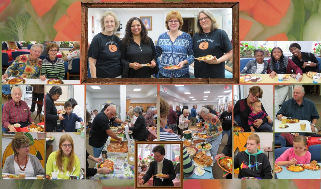
The United Methodist Church Of Lake Ronkonkoma