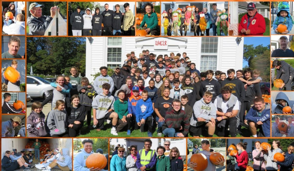
The United Methodist Church Of Lake Ronkonkoma