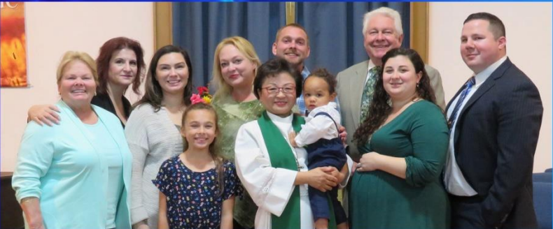
The United Methodist Church Of Lake Ronkonkoma

The following support groups hold meetings in our building: