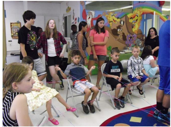
A welcome back party was held during Sunday School on September 6, 2015.