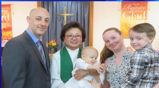
The United Methodist Church Of Lake Ronkonkoma