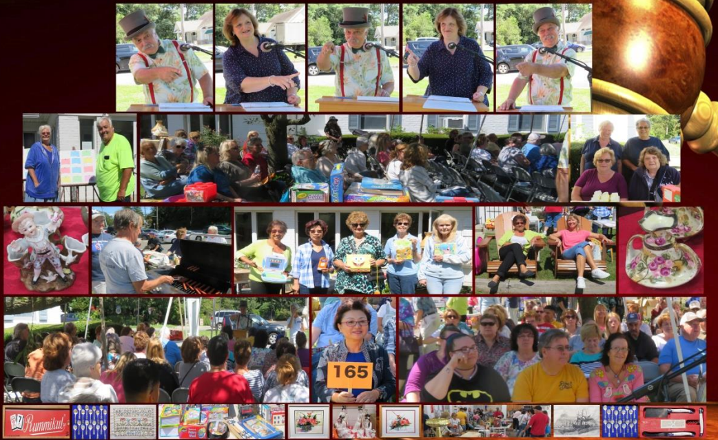
The United Methodist Church Of Lake Ronkonkoma