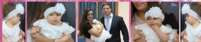
The United Methodist Church Of Lake Ronkonkoma