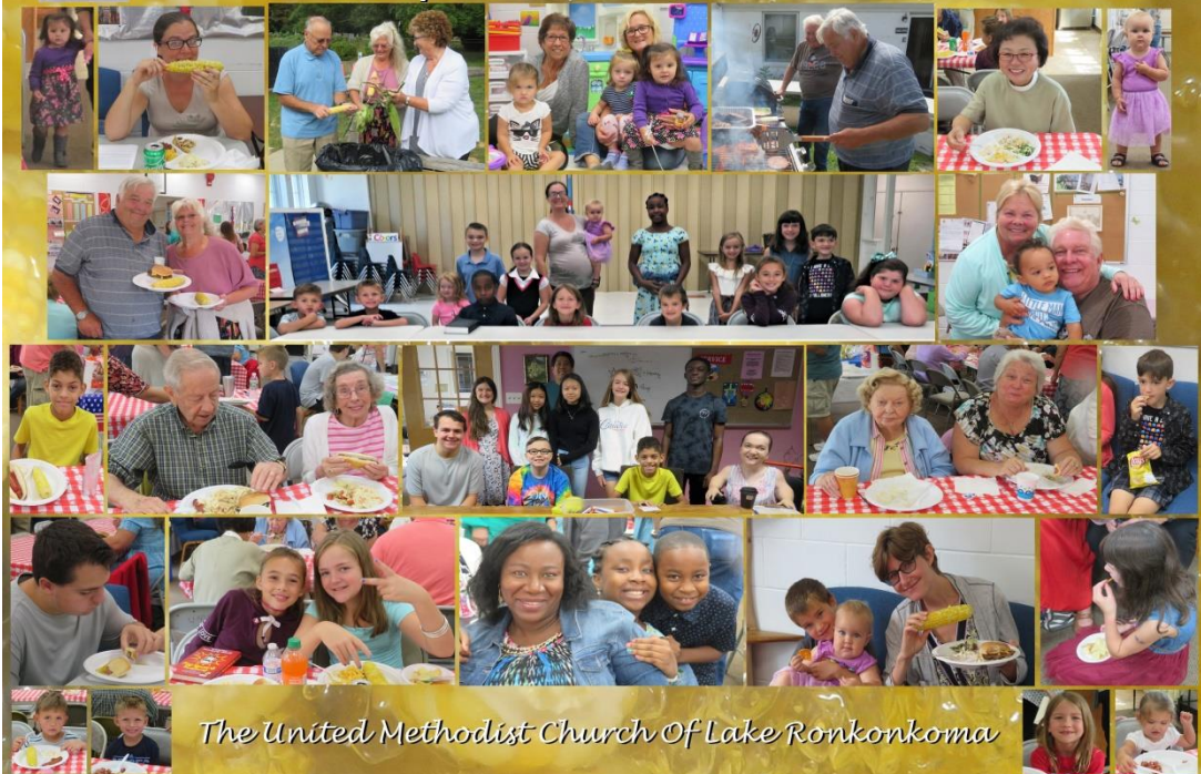
The United Methodist Church Of Lake Ronkonkoma