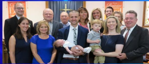
The United Methodist Church Of Lake Ronkonkoma