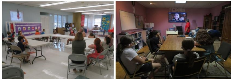
First day of Sunday School