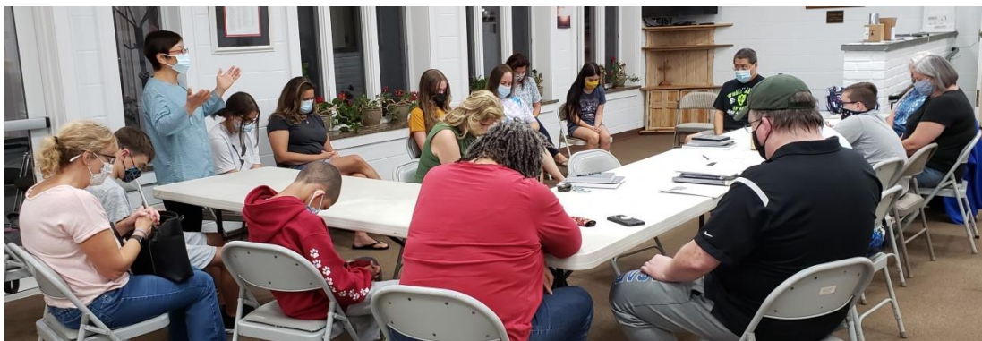
Orientation meeting of the Confirmation Class on September 15, 2021