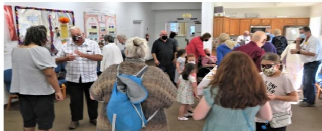
Coffee Hour Returns

The United Methodist Church Of Lake Ronkonkoma