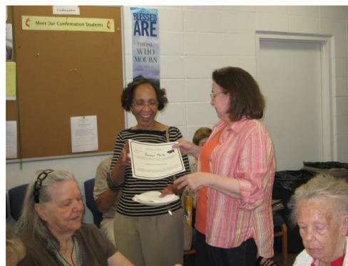
"Congratulations" to our winners!