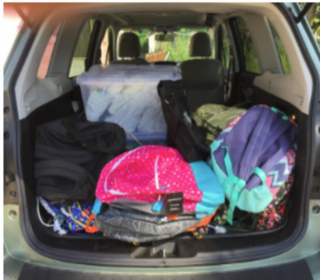
Ready for delivery!