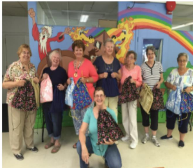
My school bag angel stuffers!