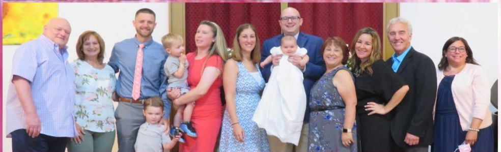
The United Methodist Church Of Lake Ronkonkoma